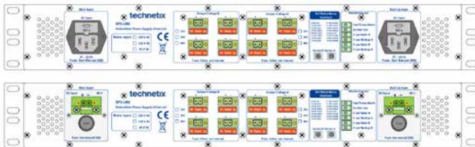
RPS-UNI back panel with connections

The PSA-30024 plug-in power supply for the RPS-UNI provides 300 W, which is enough power to feed four NCI racks. The system achieves redundancy with the