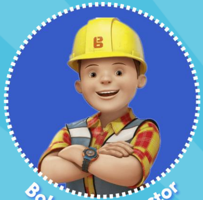
Bob El Constructor